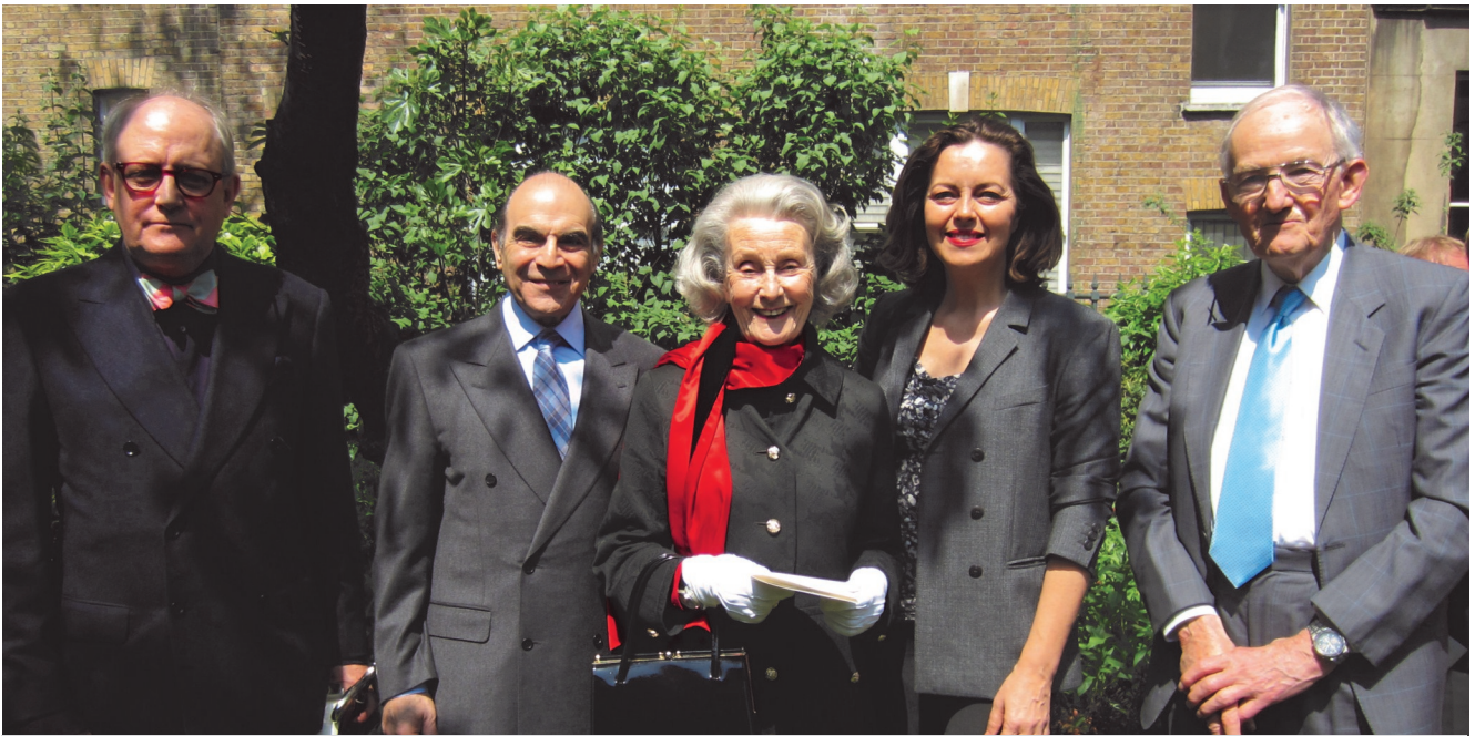
Our President and Vice-Presidents in front of the new tree (obscured); for the tree and plaque see inside...

On a blissfully sunny day in May the Society marked the centenary of Rattigan's birth with a service of celebration at the Actors' Church in Covent Garden, where Sir Terence Rattigan CBE has a plaque along with many other theatrical luminaries, including, as a close neighbour on the north wall, Sir Noel Coward.