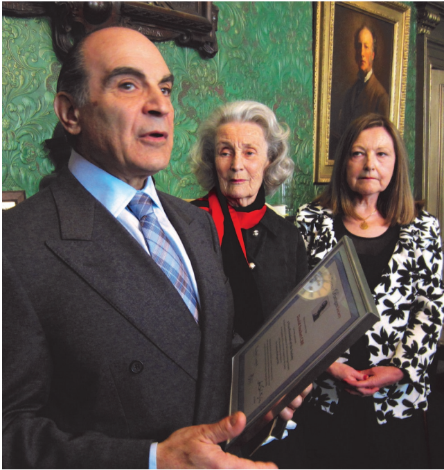
David Suchet receiving his Vice-President's scroll at the Garrick Club reception