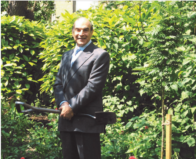
David Suchet, the onerous task of tree-planting accomplished, in the garden of St Paul's.

Continued from page 1... The tree was planted—or, rather, the last bit of topsoil was carefully put in place—by David Suchet, whose resonant speech was interrupted by the church bells at noon. We paused. Our Vice-President continued. We relished the sunshine and the convivial spirit of the occasion. Those present also included many Society members, a fair number of guests and other interested onlookers.